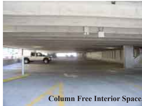
Column Free Interior Space.