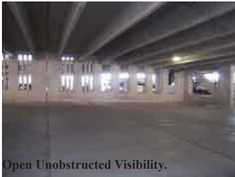
Open Unobstructed Visibility.